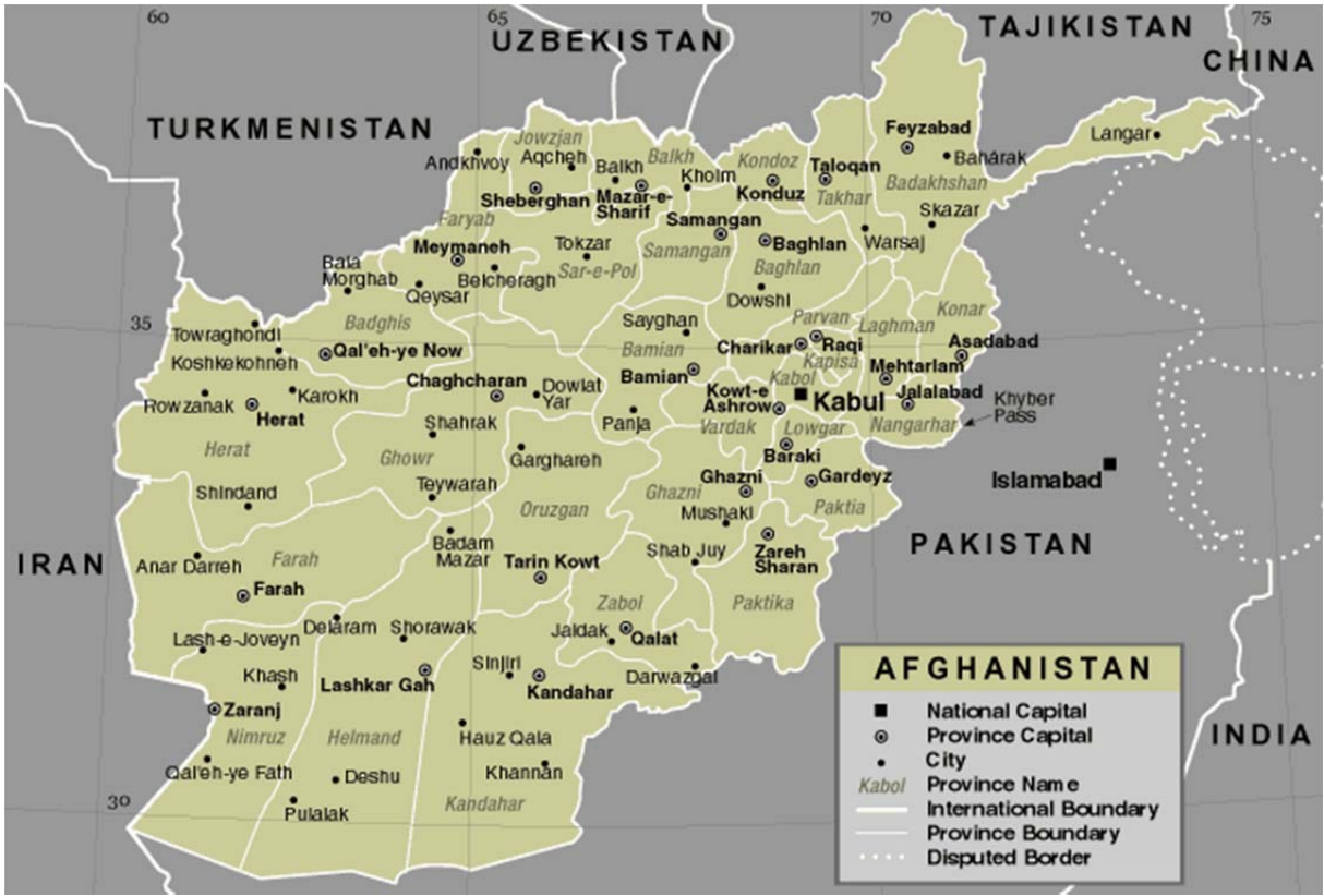
Figure 1 – National map of Afghanistan

The structure of person names in Afghanistan is very different from those found in a Western society. This raises certain issues in the transcription of Afghan names in the United States.